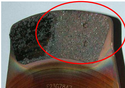
Pad partielly missing.