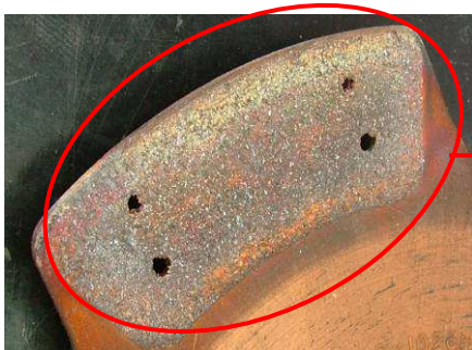
Pad totally missing.

Nota : CITROËN Sport reserve the right to refuse a warranty is the state of a disk is doubtfoul, pads totally used, or questionable warmed marks on it.